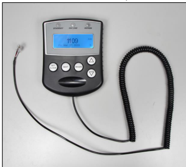
NEW Monochrome Graphics