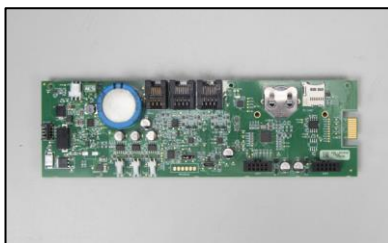
NEW Main Board