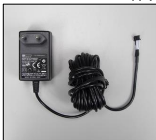
NEW EU DC Power Supply