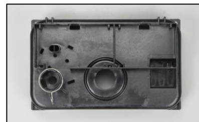
NEW Drive Bracket